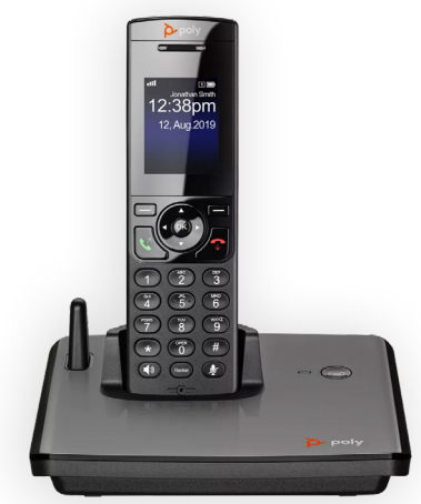
Poly VVX D230